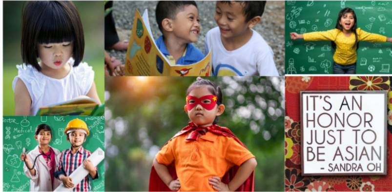
Central Queens Academy Elementary School : Achievement. Equity. Empowerment.